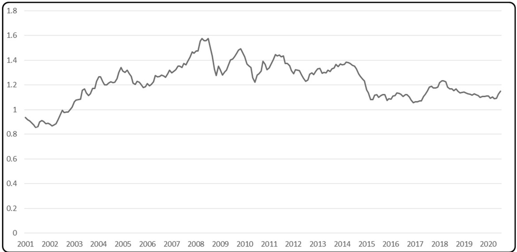
The euro/US dollar exchange rate since 2001 (the value of one euro in US dollars)