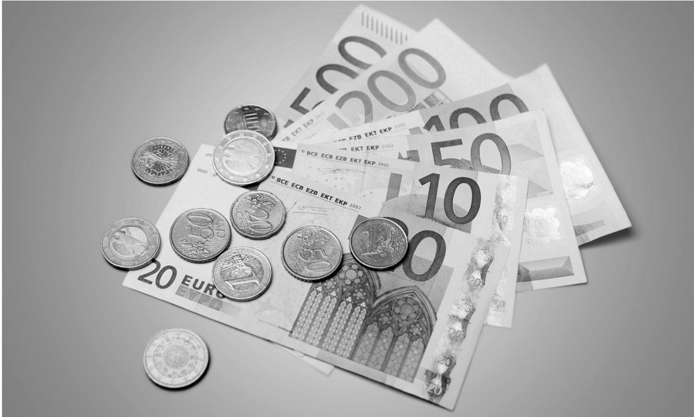
The European Currency since 2001, the Euro