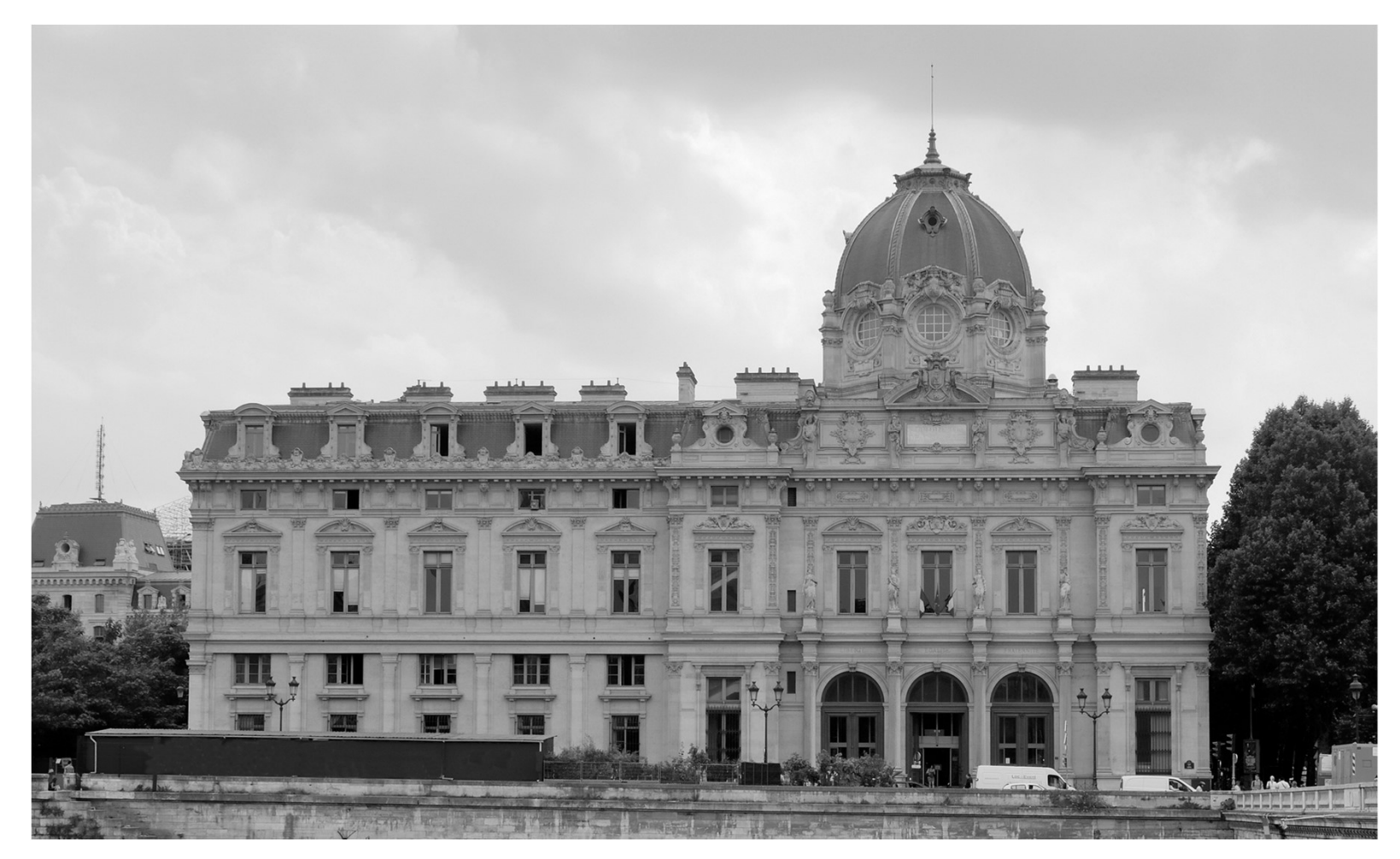
The Tribunal of Commerce in Paris, France.